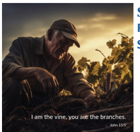
SUNDAY PRAYER SERVICE Fifth Sunday of Easter Year B Sunday 28 Apr 2024